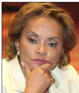
Elba Esther Gordillo

Elba Esther Gordillo, the head of Mexico’s National Education Workers Union (Sindicato Nacional de Trabajadores de la Educación, SNTE), is facing allegations of attempted extortion from a former ally. The incident has placed the spotlight on the continued power of unions in Mexico – particularly of the one run by Gordillo – while raising questions over the ability to reform education in light of historical ties between government and unions. The case is also leading to calls for audits of a number of other agencies whose members may have had connections with Gordillo and who benefitted from her suspected connections with Mexican presidents. Named allies of Gordillo have included the head of the National Lottery system (Lotería Nacional para la Asistencia Pública) and the government workers’ social security system (Instituto de Seguridad y Servicios Sociales de los Trabajadores del Estado, ISSSTE) during the administration of Mexican president Felipe Calderón, according to news reports.