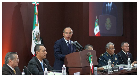
Mexican President Calderón speaking at the National Security Conference on June 30, 2011.

A new federal program called the National Program to Prevent and Sanction Kidnappings (Programa Nacional para Prevenir y Sancionar el Secuestro), which is designed to combat kidnappings in Mexico, was approved on June 30. Attorney General Marisela Morales announced the program at the 30th session of the National Security Conference (Sesión del Consejo Nacional de Seguridad), during which she described the seven main principles that provide the base for the program. According to Milenio , the main components seek to create professional unity among forces to target and disrupt criminal organizations; create a database of information on kidnappers that will assist in tracking and targeting suspects; increase citizen participation in preventing kidnapping