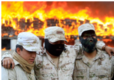
Mexican soldiers burning the marijuana found in Rosario.

According to Brigade General Alfonso Duarte Múgica, the seizure prevented about 120 tons of marijuana from reaching the U.S. market. Authorities estimated the value at $160 million, but this is quite likely a significant over-estimate. At a rate of $400 per pound, the wholesale price that Mexican drug traffickers typically obtain for marijuana, the Justice in Mexico Project calculates that the roughly 240,000 pounds of marijuana would more likely yield around $96 million wholesale. According to a recent study by the Rand Corporation, total proceeds that Mexican drug trafficking organizations receive from marijuana amount to between $1-2 billion annually. Thus, whatever calculations used, this was a major bust.